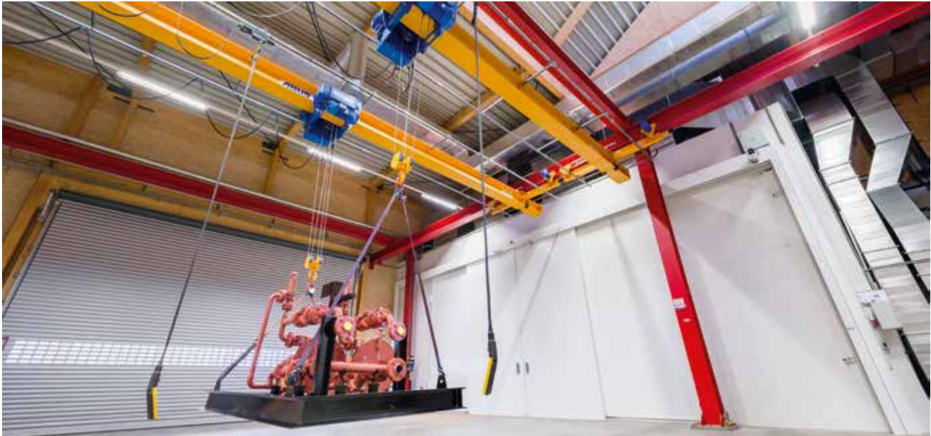
There are sufficient cranes for handling the modules.

Competence, room and facilities for module building.