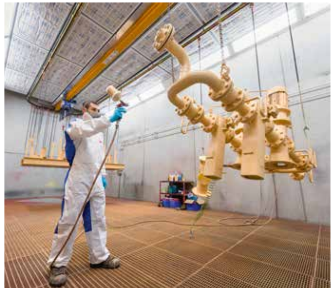
One of two paint shops.