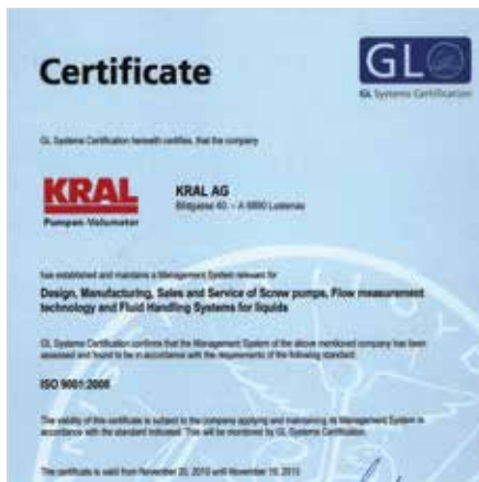
Quality management certificate.

The high technical standard of our systems is based on expertise and certified by numerous certificates.