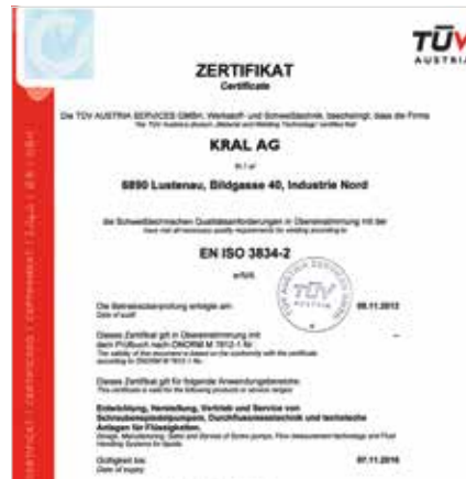
Welding specialist certificate.