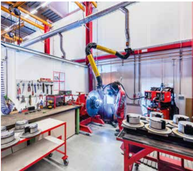
One of five modern welding booths.