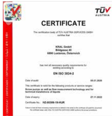
Welding specialist certificate.