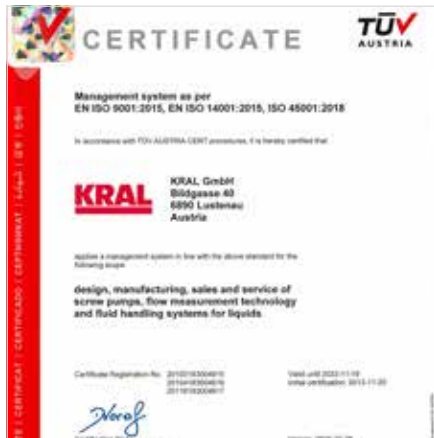
Quality management certificate.

The high technical standard of our systems is based on expertise and certified by numerous certificates.